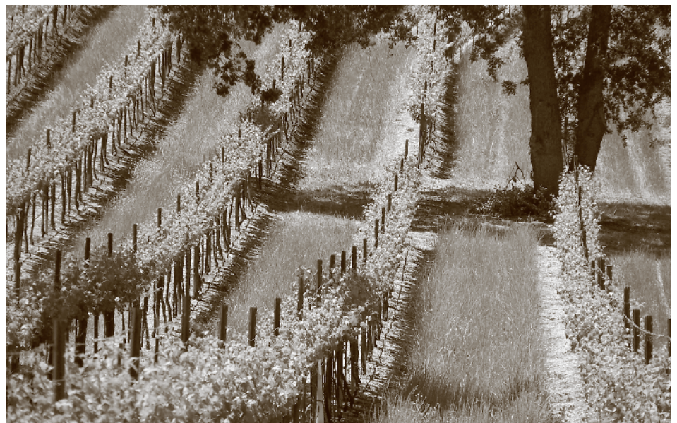
Pomar Junction Vineyard, a member of the award-winning Central Coast Vineyard Team.