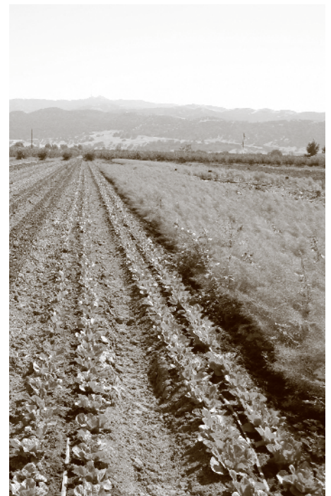
Use of insectary crops like fennel (right) on an organic farm in the Salinas Valley is a practice that may be supported in future farm bills.

Other sections of the last Farm Bill that addressed sustainability issues included the Farmers’ Market Nutrition Programs and Community Food Security Grants in the nutrition section (Title IV); funds for on-farm renewable energy systems in the energy section (Title IX); and the specialty crop purchasing program for school