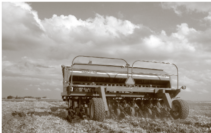
Conservation tillage production systems reduce fuel use by minimizing tillage operations between crops including disking or plowing.

Or run our agriculture. Kunstler reviews the various alternatives to oil, including biofuels, and concludes that for most part, the energy returned does not greatly exceed the energy invested in its production. For many years, Cornell University's David Pimentel has been raising this concern about the way biofuels, including ethanol, are produced. Without fuel for our machines, both organic and conventional agriculture will become much more difficult and labor intensive. It is easy to forget that cheap power is only a recent phenom-